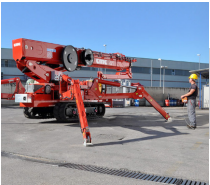
Remote Control Station