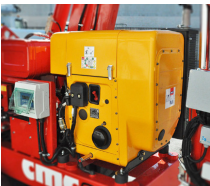
Hatz Silenced Engine