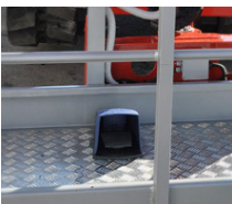
"Dead Man" Safety Device in Basket